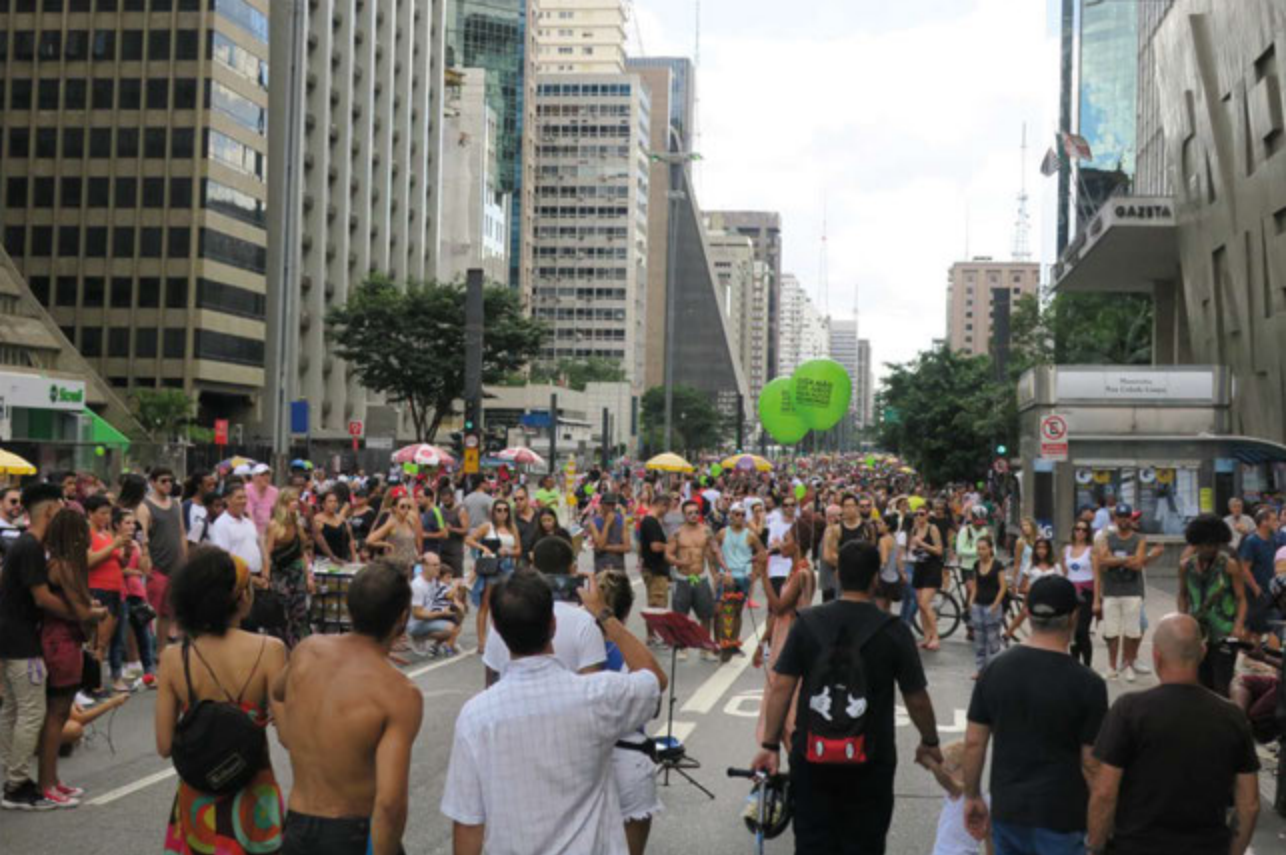
Performance during a car free Sunday on Avenida Paulista, Sao Paulo, Brazil.

mono-functional transportation strips dominated by motorized vehicles and protected in this use by societal practices and legal regulations.