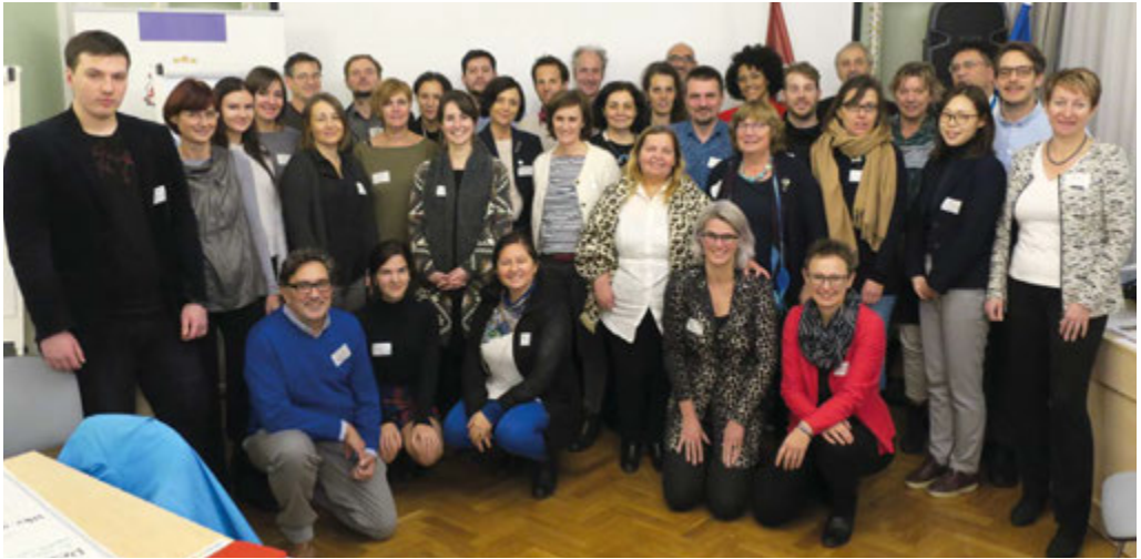
Participants of the AGORA Workshop in Riga in November 2019

below wraps up the main dilemmas and challenging urban issues discussed in AGORA session in Valencia in June 2019.