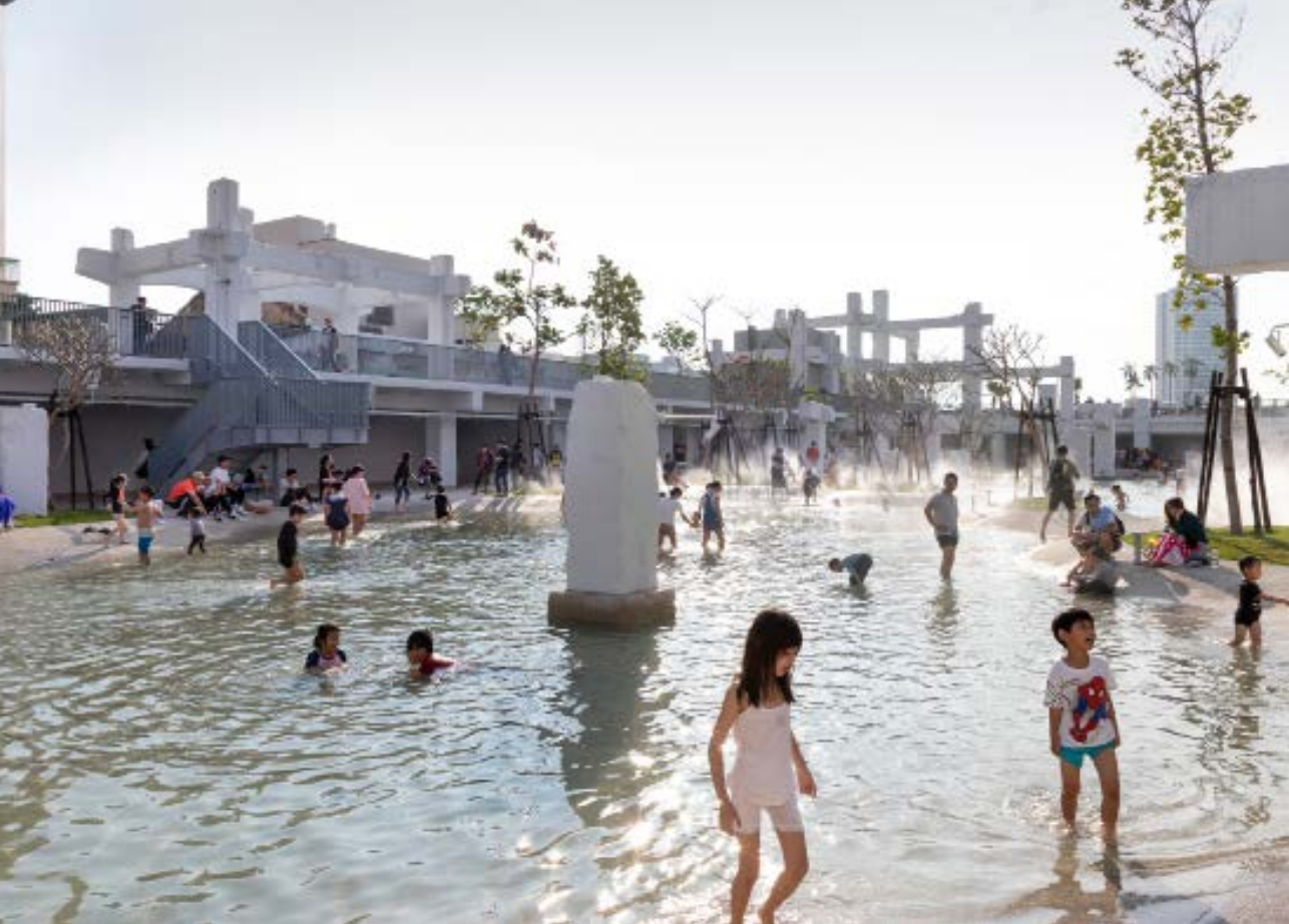
Tainan Springs, Tainan, Taiwan: A former shopping centre transformed into an urban lagoon. Architect: MVRDV.