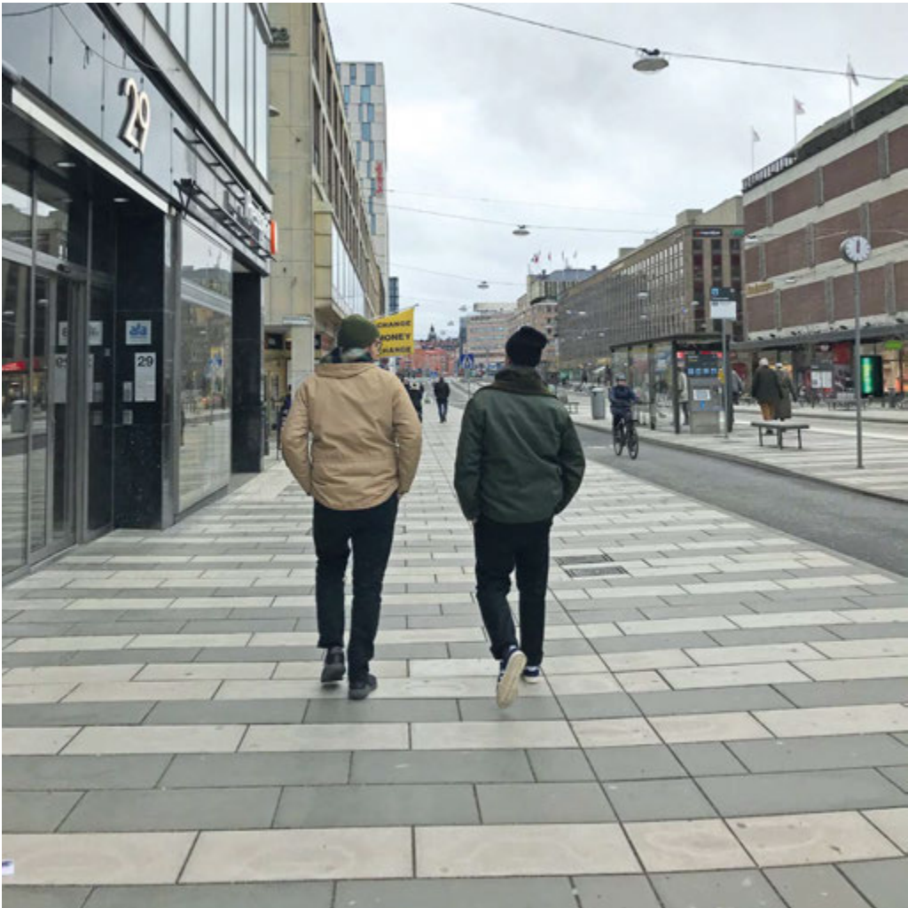
The two editors out and about in public space in Stockholm in early March, just before the big outbreak / lock down.“