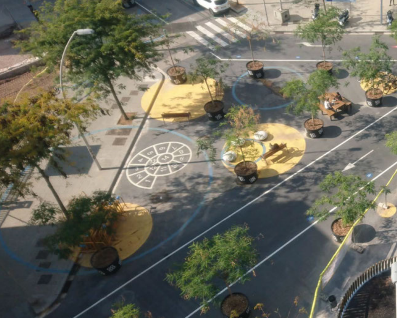
Superblock in Barcelona.

the imaginary for communicating urban transformation should be as diverse as the users' needs in regards of future urban spaces. To build this local alliance and raise the sustainability of interventions, the transformation of streets as urban public spaces should be co-created together with citizens. Various approaches for street transformation can be experimented with (Bertolini, 2020) making the potentials of urban transformation more tangible for residents.