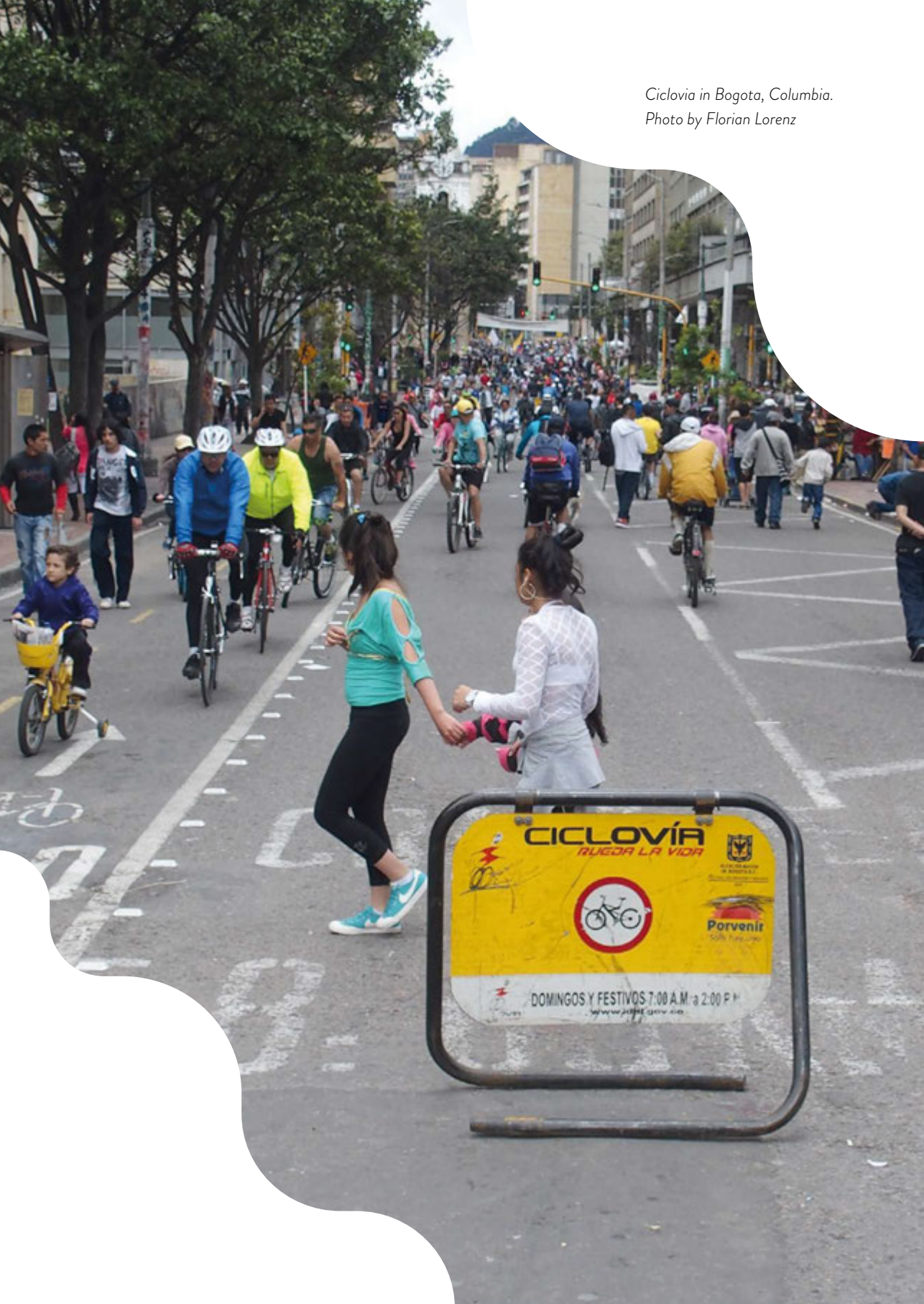
Ciclovia in Bogota, Columbia.