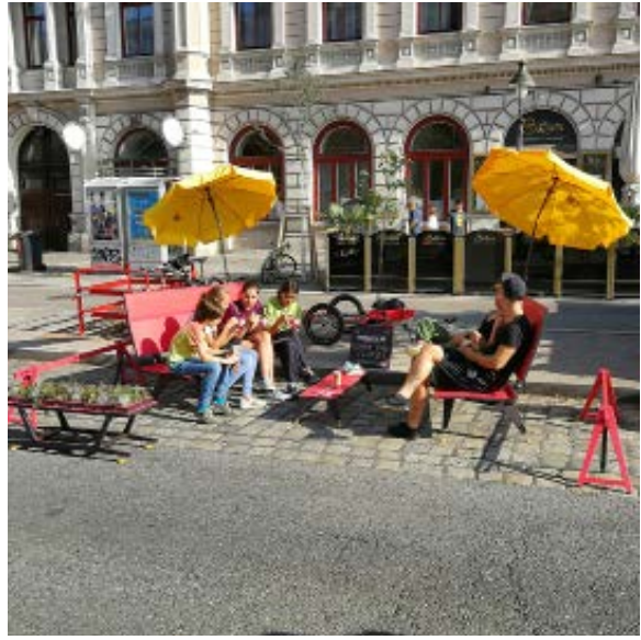
Parklet2Go: an urbanistic tool for testing, evaluating and discussing the transformation of specific (parking) spaces in an effective and informal way.

towards stationary vehicles that occupy public spaces. A straightforward policy with long-term impact is to reshuffle the land-use hierarchy (and the aligned imaginary) within streets by implementing on-street parking schemes to reduce on-street parking gradually shifting the spatial balance towards more sustainable and lively uses. This will free space to revalue streets as public spaces of wellbeing and environmental quality while at the same time accelerating a wider shift in mobility behaviour towards sustainable forms of transport.