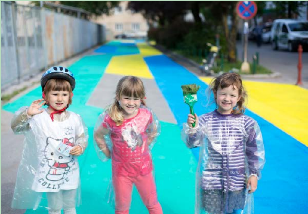
ProstoRož mission is to enhance the quality of underused public urban spaces in Ljubljana, Slovenia.

their exclusive burden. Temporariness means that a plan for maintenance and removal of spatial intervention must be implemented together with the intervention.”