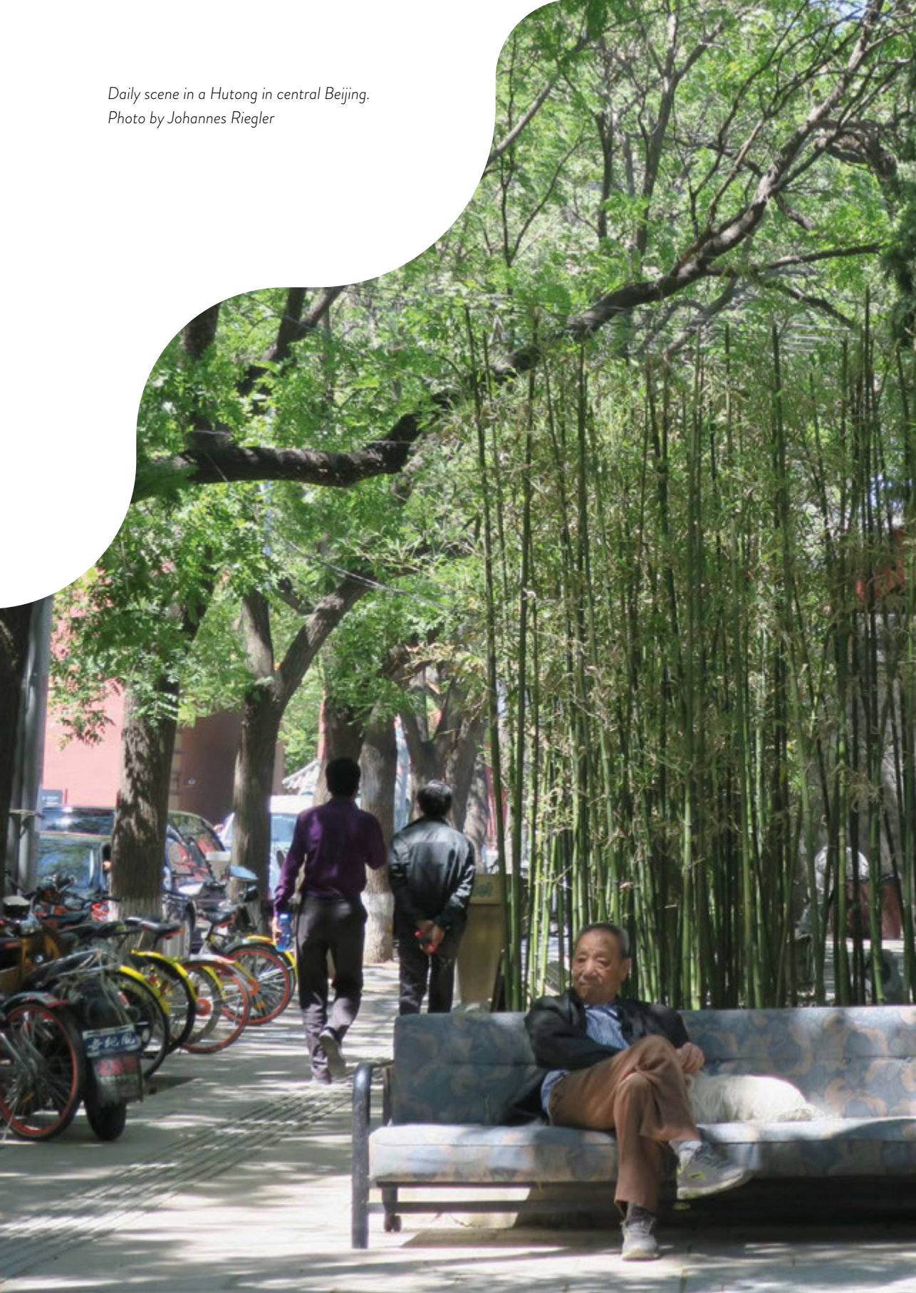
Daily scene in a Hutong in central Beijing.