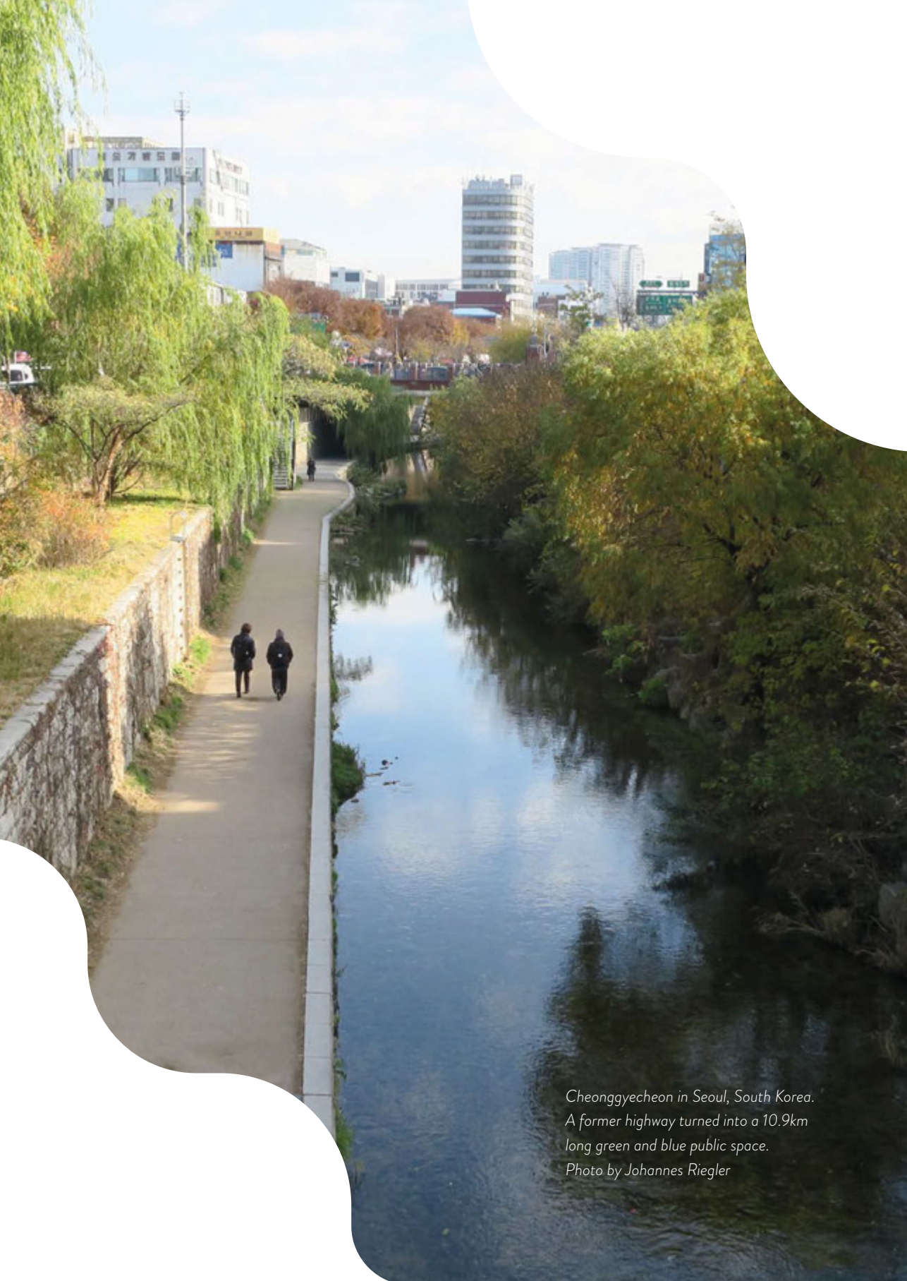
Cheonggyecheon in Seoul, South Korea. A former highway turned into a 10.9km long green and blue public space.