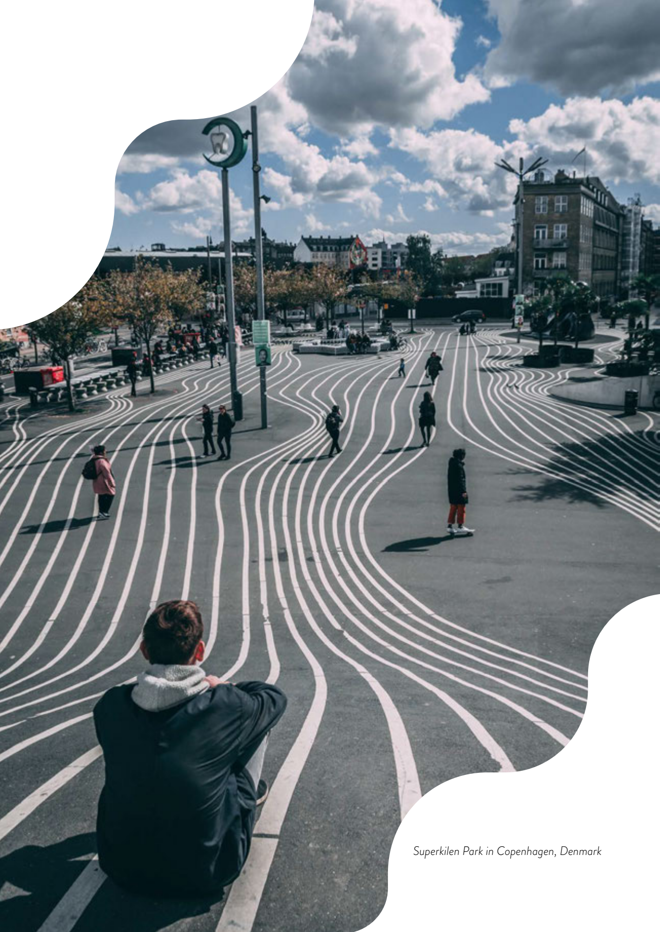
Superkilen Park in Copenhagen, Denmark